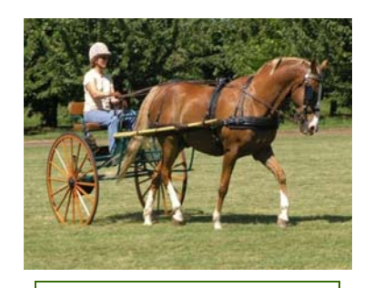
Conserve on gas and help the air. Drive to work!